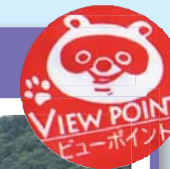
Full view of Ainokura Village Photo spot

The World Cultural Heritage & National Historic